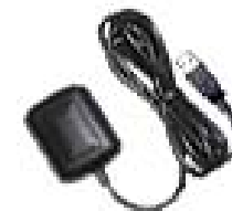
Rayming TripNav TN200 USB GPS Receiver